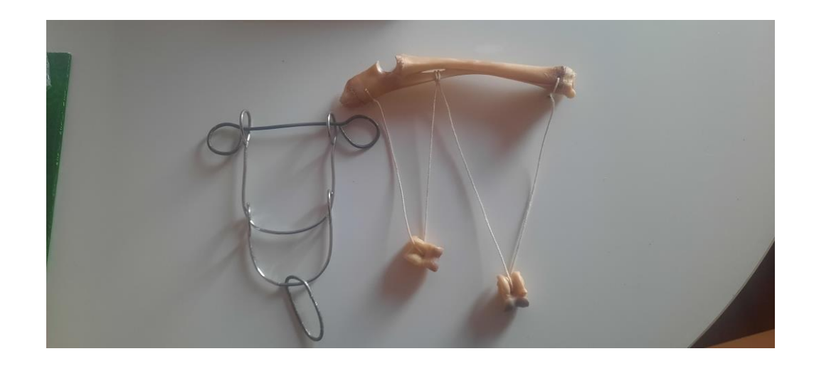
3rd PLACE toy made of bone and iron